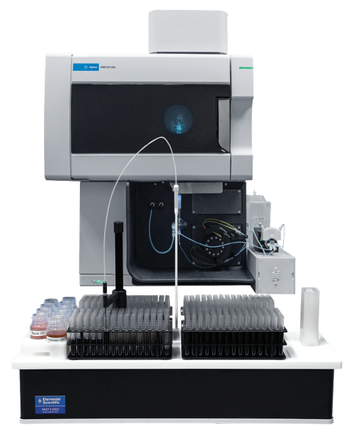
SampleSense Oil Analysis System with Agilent 5900 ICP-OES

SampleSense Oil is a complete, automated sample introduction system for oil analysis. It combines the DXCi Autocorrecting Autosampler with SampleSense technology to fully automate the sample loading process. After the sample is mixed, the unique SampleSense valve automatically detects the presence of sample as it is loaded rapidly from the autosampler. Once the sample loop fill is confirmed by the sensors, the sample is automatically injected and the ICP-OES analysis is triggered for a tightly timed analytical sequence.