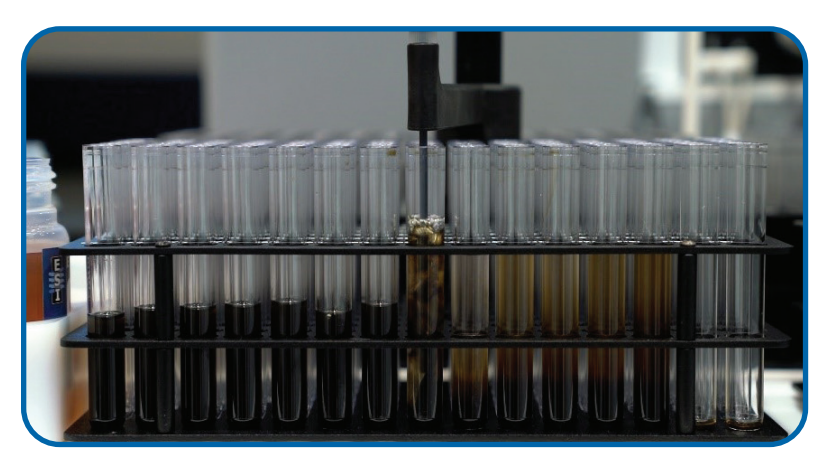
Gas infusion mixing of used oil and solvent with SampleSense Oil system just prior to analysis on Agilent 5900 ICP-OES